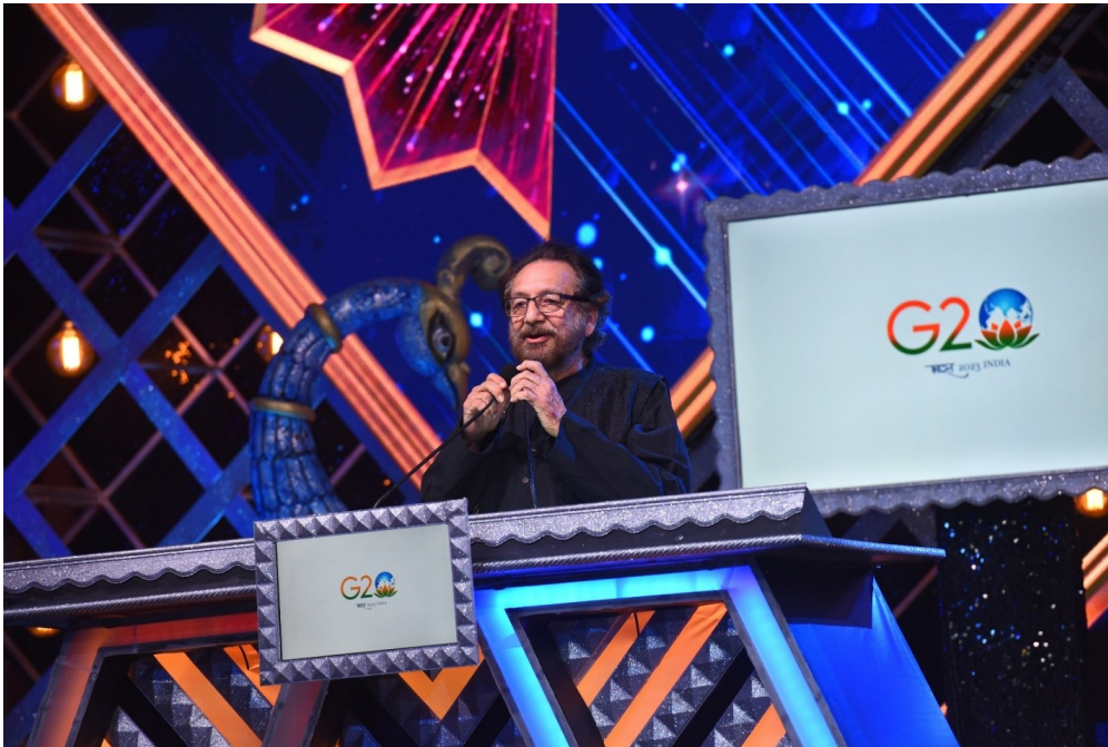
In Photo: Chairperson of the International Jury of IFFI Shekhar Kapoor addressing the audience at the closing ceremony.

Reinforcing the state's commitment to foreign filmmakers coming for shooting, the Chief Minister said that with the lushgreen forests, river, waterfalls, villages and terrace rice fields, Goa will be filmmakers' paradise as it offers a mix of traditional and modern house settings. "Streamline system of shooting films in the state offers hassle free permissions to access diverse locations. I stand committed to make region of Goa the heaven for film industry. The plan is underway to develop infrastructure providing cutting edge technology and incentivize the international film makers", he elaborated.