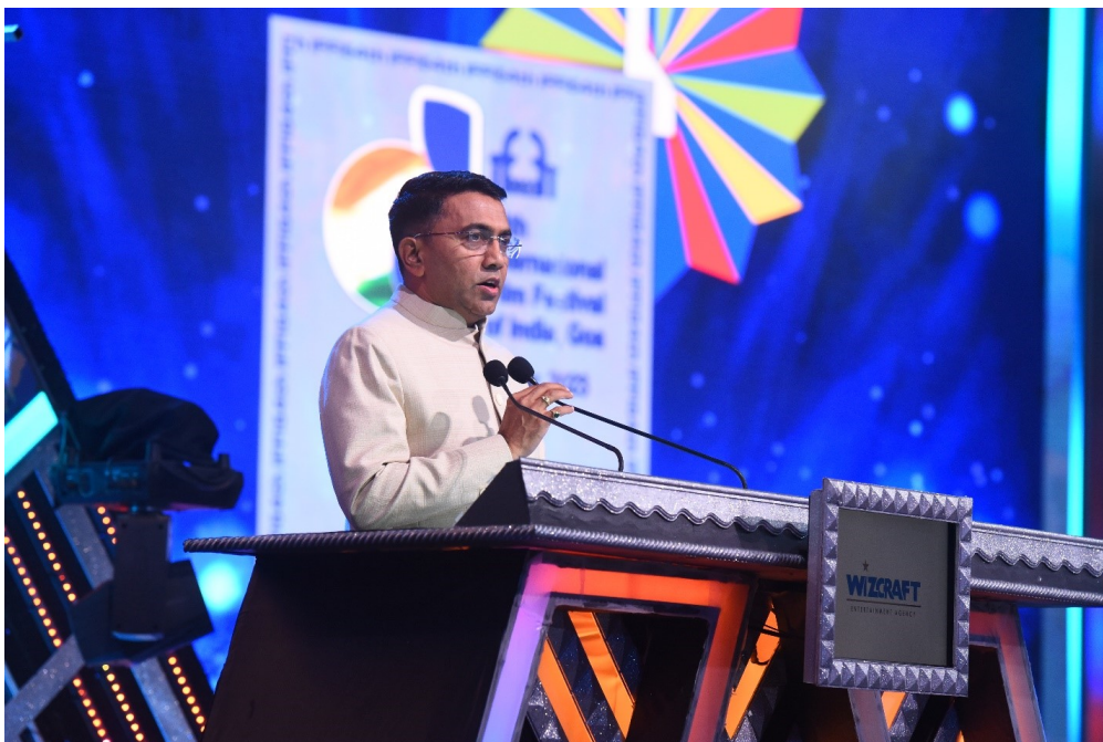
In Photo: Goa Chief Minister Pramod Sawant delivering welcome address at the closing ceremony

Shri Sawant also added that the festival is particularly special for Goa as it showed the cultural heritage of the state by providing a platform for the Goan film makers to showcase their talent and creativity. He added that the participation of Goan film makers in this year's film festival is truly remarkable.