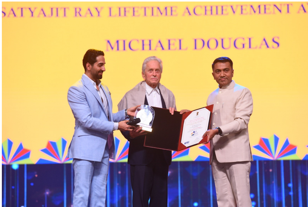
In Photo: Hollywood actor and producer Michael Douglas receiving Satyajit Ray Lifetime Achievement Award