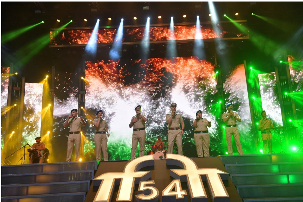
In Photo: Cultural performance at the closing ceremony