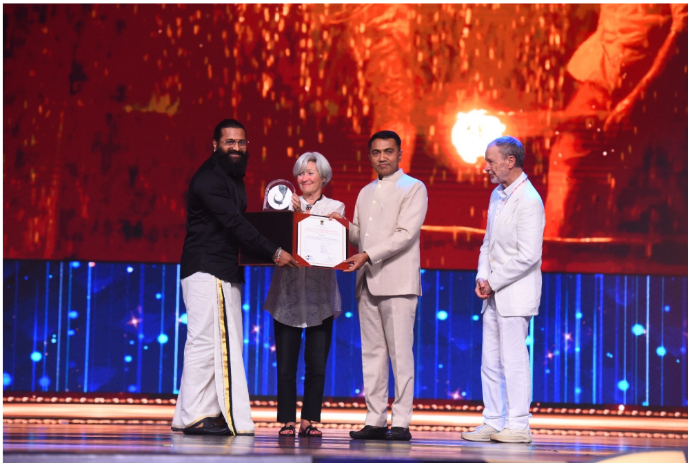
In Photo: Kannada Film Maker Rishabh Shetty receiving The Special Jury Award for Kantara