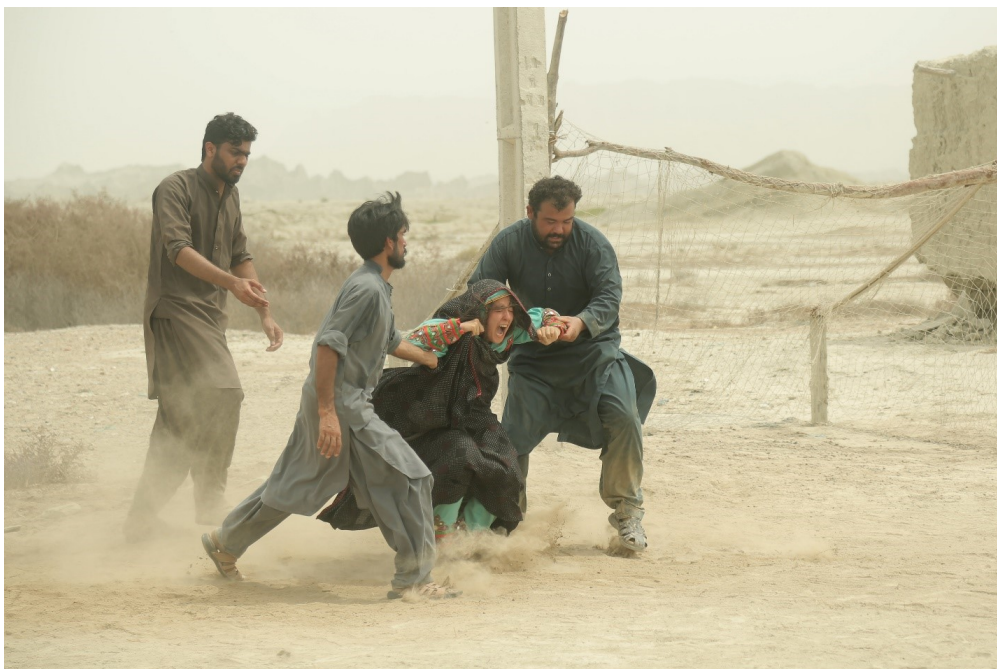
In Photo: A still from the film Endless Borders which bagged Golden Peacock at IFFI