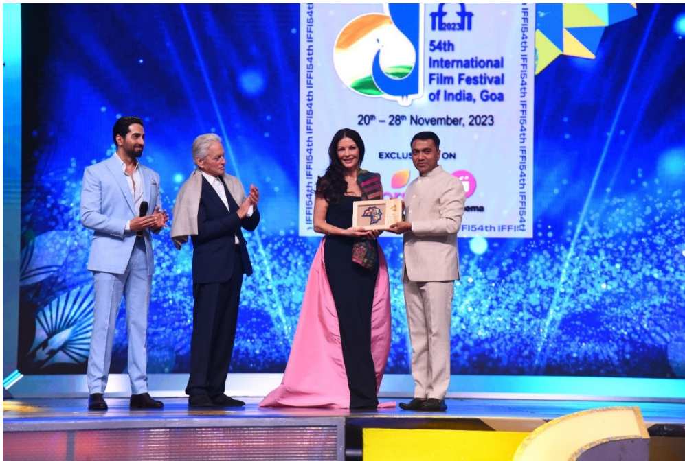
In Photo: Catherine Zeta Jones being felicitated at the closing ceremony

Catherine Zeta Jones, an eminent actress and the wife of Michael Douglas, was also felicitated. Catherine said it was heartwarming to see the generosity and hospitality they received in India.